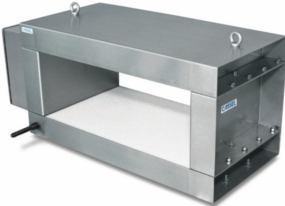
Sensor head TU

Applications: Plastic recycling Rubber production Wood and paper processing Food related industries