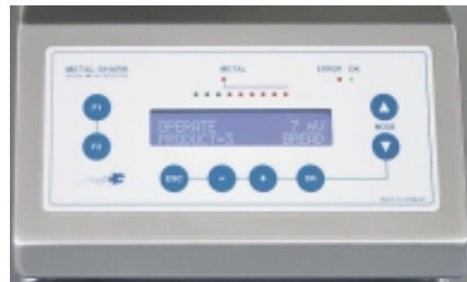
Digital control unit SHARK